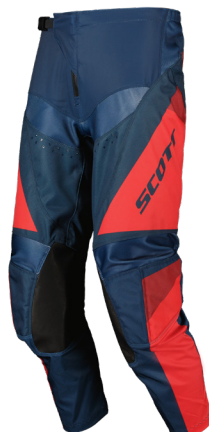
dark blue/neon red 7698