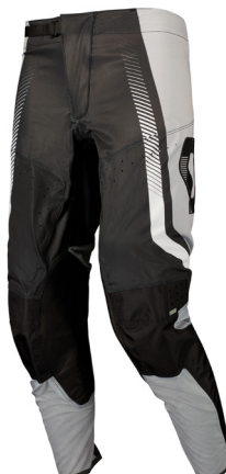
premium black/grey 7700