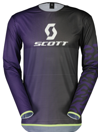
dark purple/mint green 7696