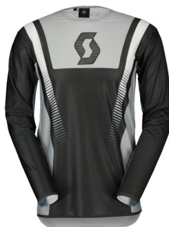
premium black/grey 7700