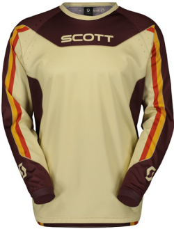
deep brown/beige 7699