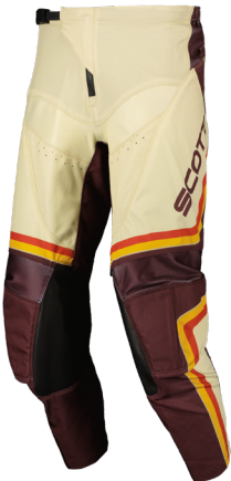
deep brown/beige 7699