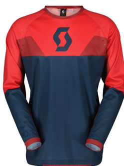
dark blue/neon red 7698