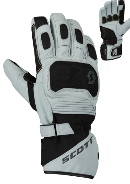
dark grey/black 2006