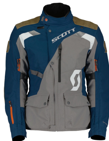
blue/titanium grey 7421