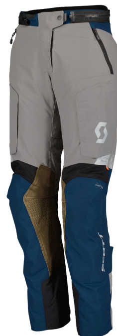
blue/titanium grey 7421