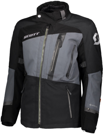
black/iron grey 3862