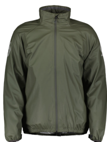
olive green 3769