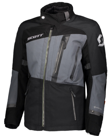
black/iron grey 3862