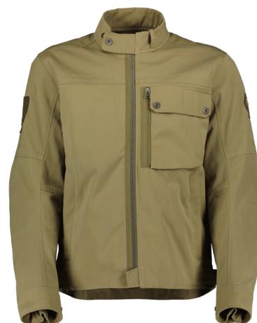
covert green 7422