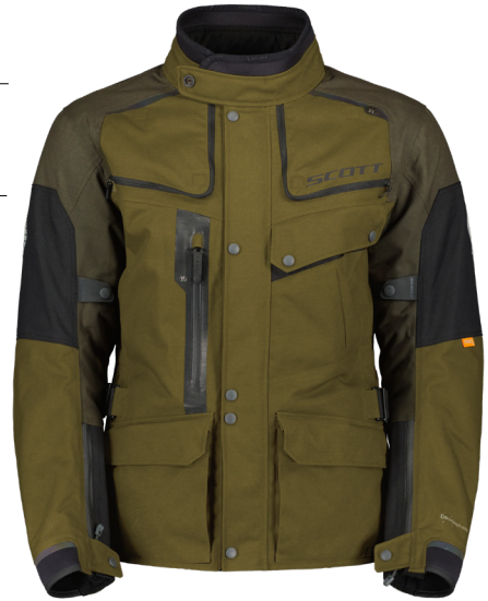
earth brown/black olive 7418