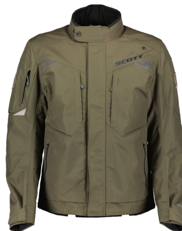
black olive 7437