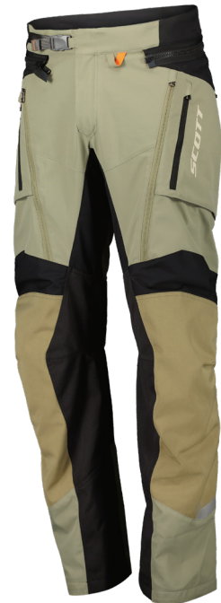
dust grey 7633