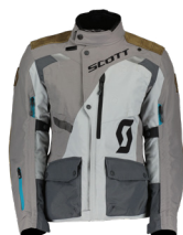
iron grey/titanium grey 7419