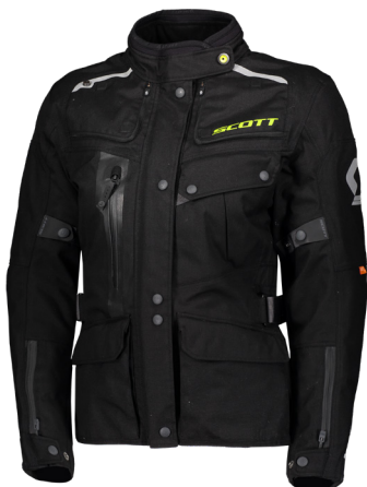
black/iron grey 3862