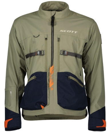
dust grey/dark blue 7686