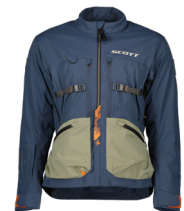
metal blue/dust grey 7687