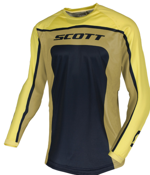
beige tan/blue 7416