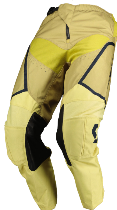
beige tan/blue 7416