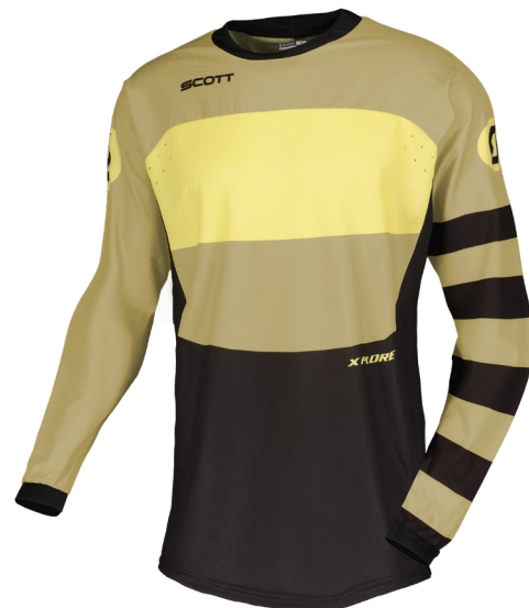
beige tan/black 7417