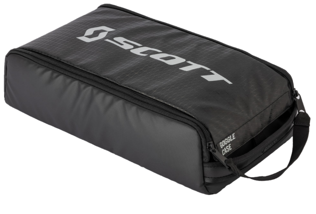
black/dark grey 1659