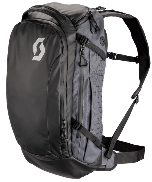
black/dark grey 1659