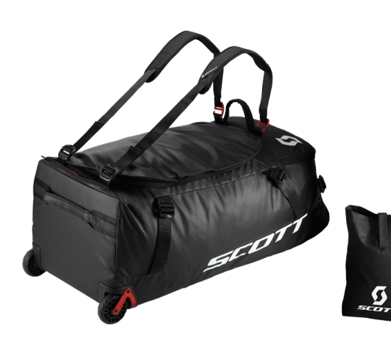
black/red clay 5446