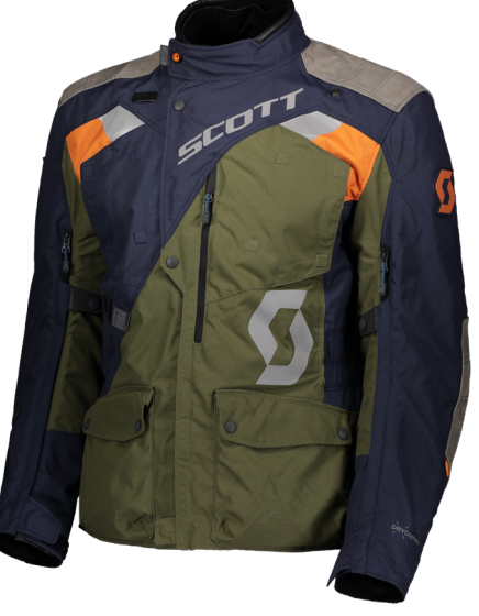
night blue/moss green 6368 (COLOR AVAILABLE IN D-SIZE)