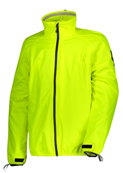
yellow 0005 vailable in D-Size