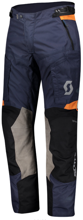
night blue 3032