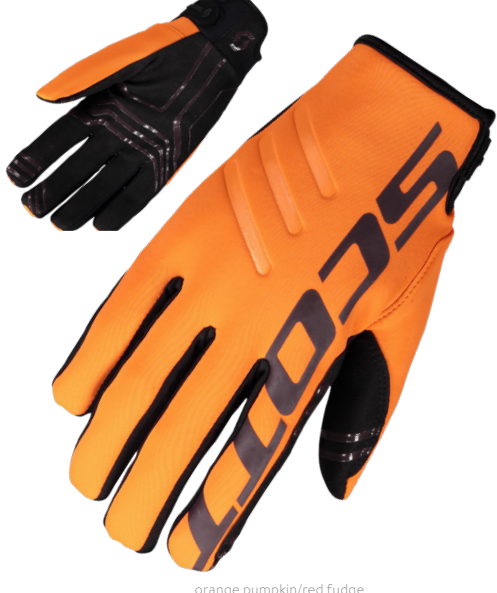
orange pumpkin/red fudge 6641