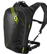
black/neon yellow 4755