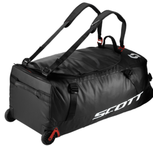
black/red clay 5446