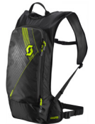
black/neon yellow 4755