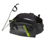
black/neon yellow 4755