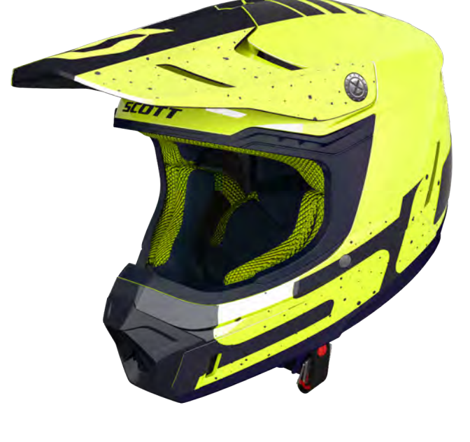
yellow/deep blue 6019