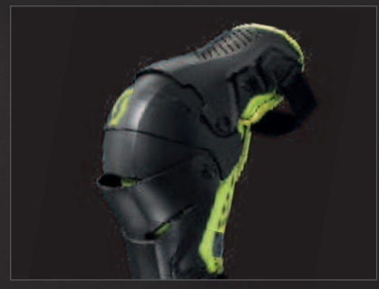
FULLY BENT KNEE