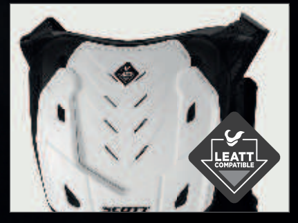
PERFECT LEATT® INTEGRATION