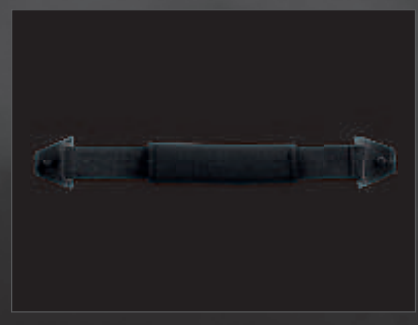
ELASTIC STRAP WITH NEOPRENE SLEEVE