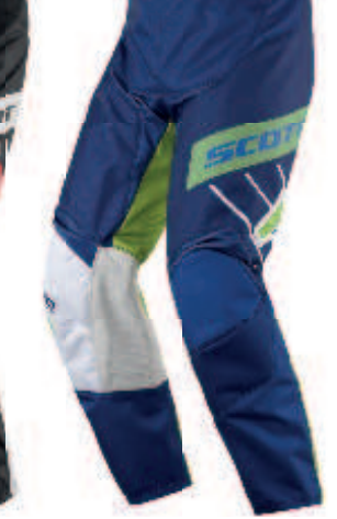
white/blue - 1029