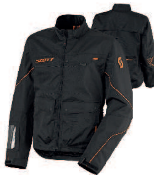
black/orange - 1009