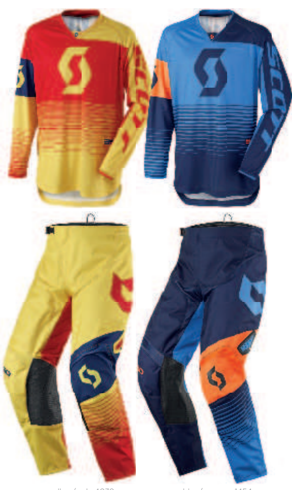
yellow/red - 4039