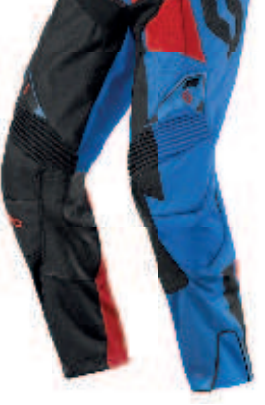
blue/red - 5411