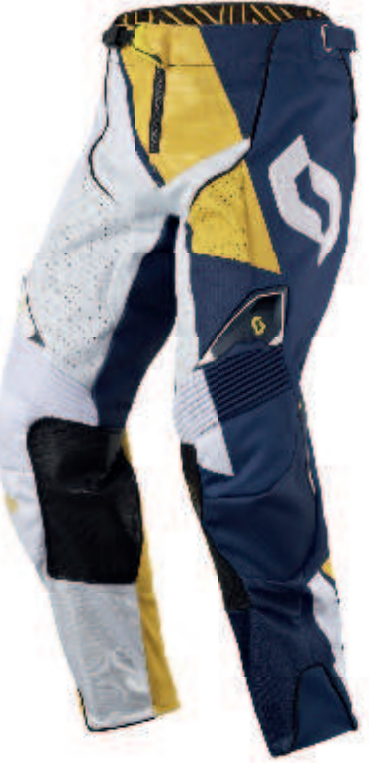
blue/yellow - 1054