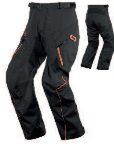
black/orange - 1009