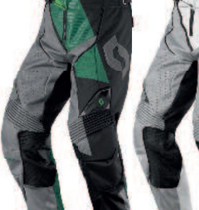
black/green - 1043