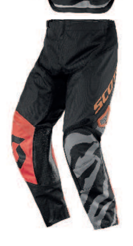
black/orange - 1009