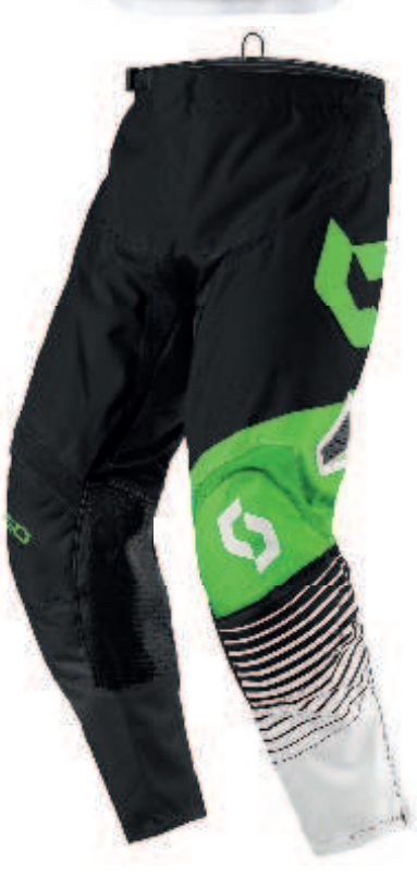
black/white - 1007