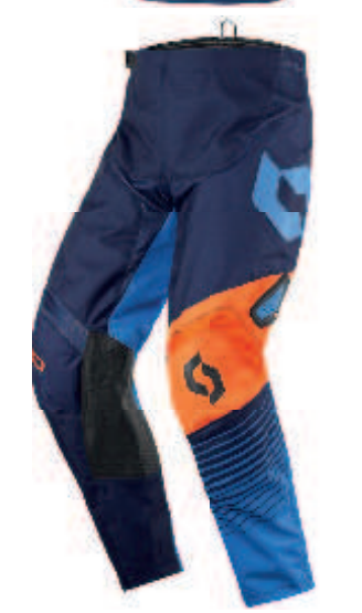
blue/orange - 1454